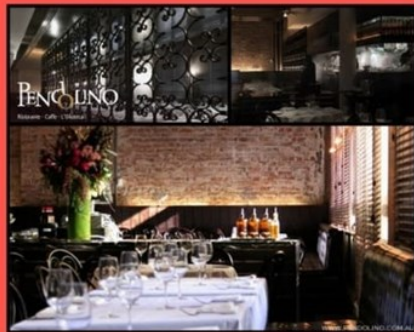
$350 voucher to The Pendolino Restaurant