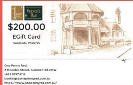
$200 voucher to One Penny Red