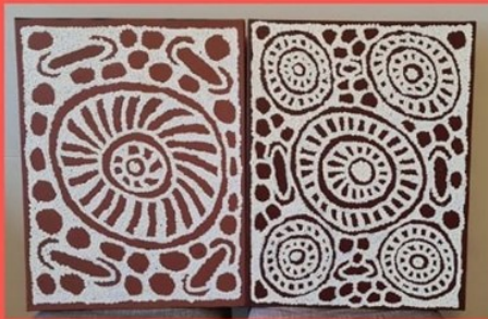
2 paintings donated by OzAboriginal