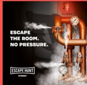
Escape Room voucher for 2