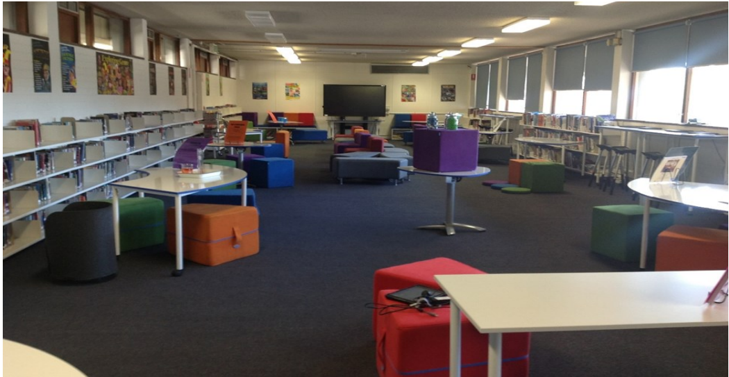
The Brain Crusade – the Library was a great space for Brain Crusade Day!

This Year the 8 Poseidon team teachers decided to have a different kind of team day. Their plan was a dynamic day of brain puzzles and problems all solved by the clever boys of 8 Poseidon using the full range of Multiple intelligences. The set-up was nine workstations, all offering a different cognitive problem to be solved by the competitive teams of three. Logical-Mathematical puzzles, Verbal-Linguistic conundrums, Spatial challenges and even a Musical task.