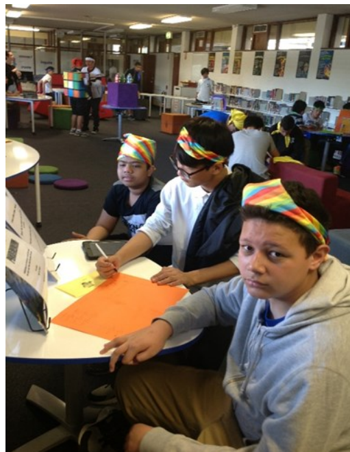
The Multi-Colour Team were amazing trying the Palindrome workstation!