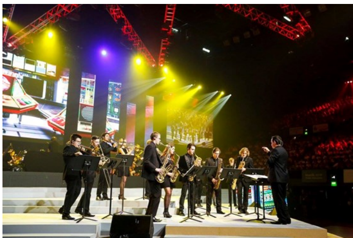
Stage Band