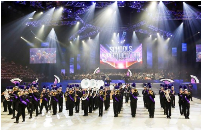
The NSW Public Schools Millennium Marching Band