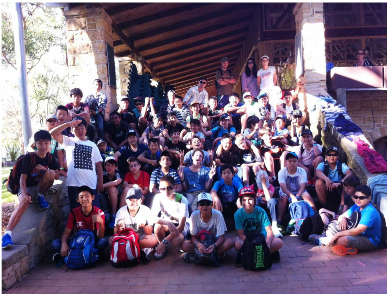
Year 7 Camp participants 2014