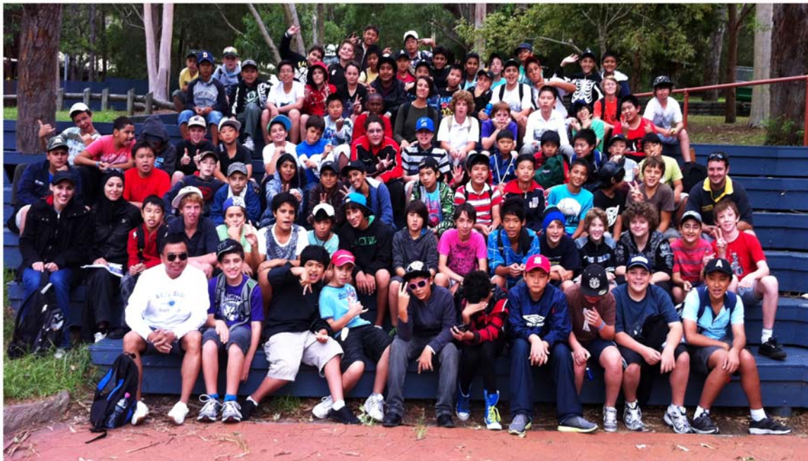
Year 7 2011 Group Photo

The response from students was fantastic, and this experience has helped them build friendships and confidence in social interactions.